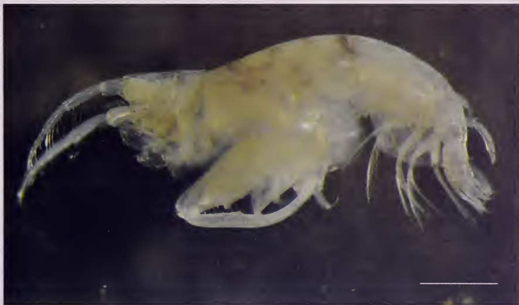
Figure 2.- Microjassa cumbrensis . Female. Scale: 0.5 mm.

Description. - Length 2.8 mm, whitish. Coxal plate 1 small, plates 2-4 very large and equal, being broad the last one (plate 4). Head triangular, with broad lateral lobes. Eyes large and round. Antennae with few long setae (10-15); antenna 1 short, with flagellum articulated (3-4) and accessory flagellum very small (1-articulate). Antenna 2 almost equal than 1, flagellum articulated (3-4). Gnathopod 1 propod ovoid, palm with 3 slender spines, dactylus slender with inner margin with tooth. Gnathopod 2 similar to 1, except merus with an enlarged posterior lobe. Pereopods long and slender, 5-7 basis broad and slightly oval. Uropods 1-2 with outer ramus slightly shorter than inner. Uropod 3 with elongate peduncle, inner ramus with an apical spine, outer ramus with distal denticles.